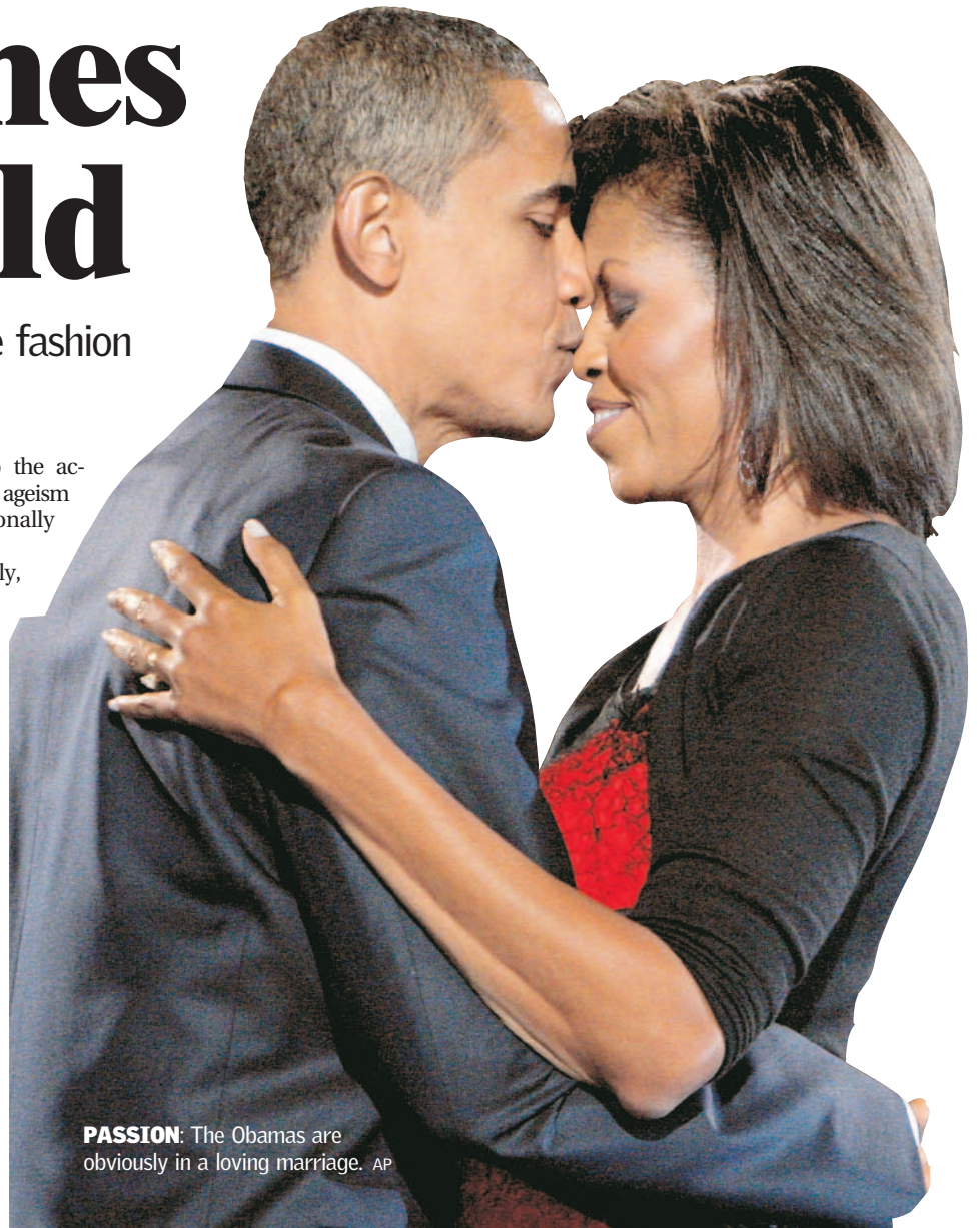
PASSION: The Obamas are obviously in a loving marriage.

Equally importantly, her relationship gives every impression of being enviably happy — without the hair-tossing melodrama of the union between Bruni and Sarkozy, or the stomach-churning cheesiness of Tony and Cherie. Unlike the Clintons, the compromises of attaining high office haven’t dented the Obamas’ mutual affection. Their interaction is genuine, unforced; their dancing at various balls was positively hot. — Telegraph